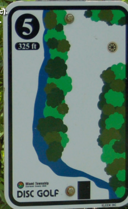
Hole 5 at Community Park's Disc Golf Course